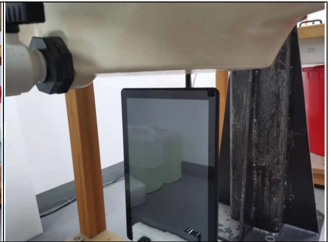
Right Side of EUT with 1.9cm Gap