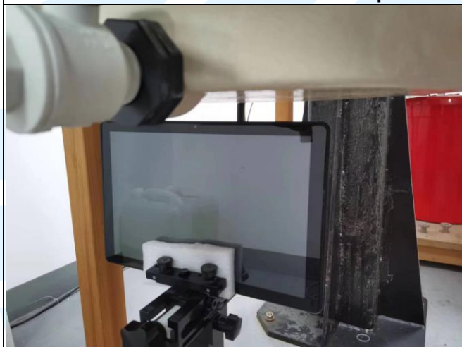
Top Side of EUT with 1.9cm Gap