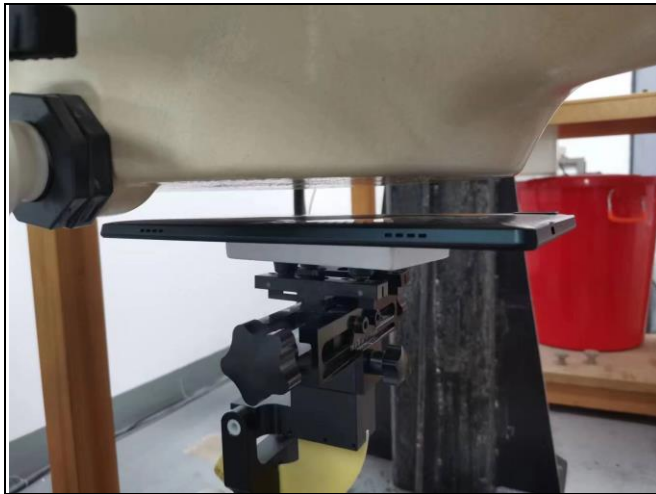
Rear Face of EUT with 1.9 cm Gap