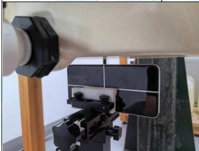
Left Side of EUT with 1.0 cm Gap