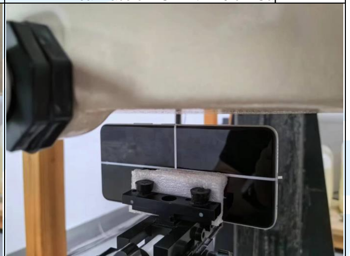
Right Side of EUT with 1.0 cm Gap