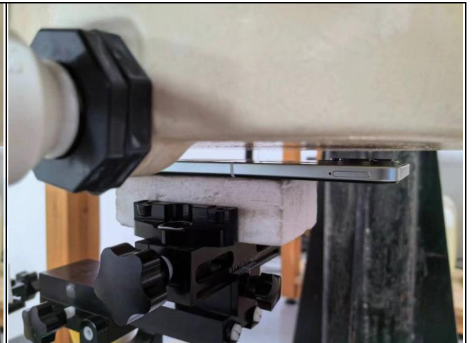
Rear Face of EUT with 1.0 cm Gap