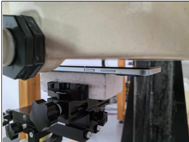
Front Face of EUT with 1.0 cm Gap