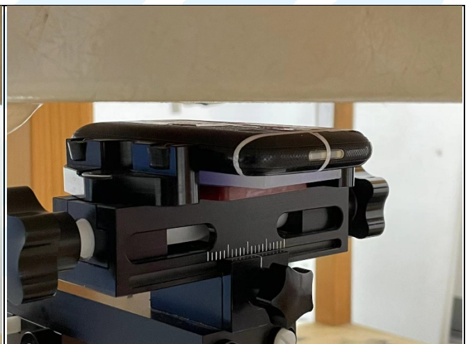
Rear Face of EUT with 1.0 cm Gap