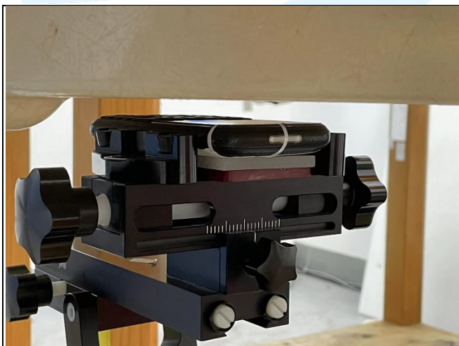
Front Face of EUT with 1.0 cm Gap