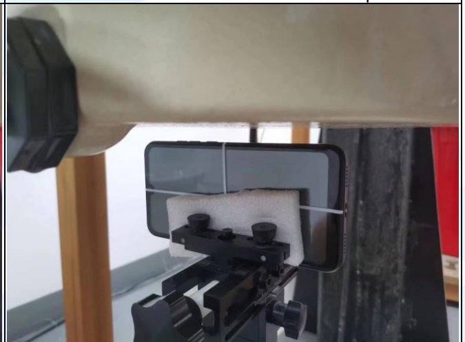
Right Side of EUT with 1.0 cm Gap