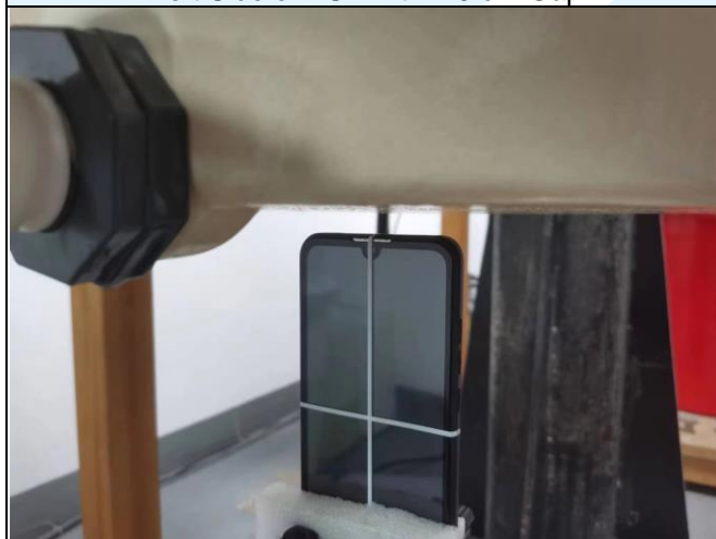
Top Side of EUT with 1.0 cm Gap