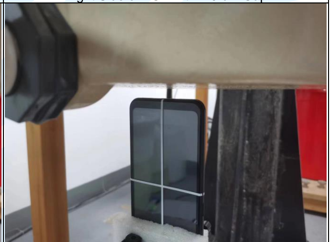
Bottom Side of EUT with 1.0 cm Gap