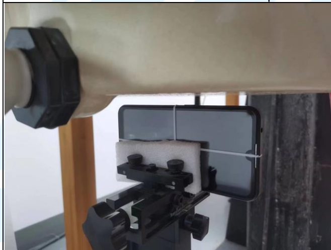
Left Side of EUT with 1.0 cm Gap