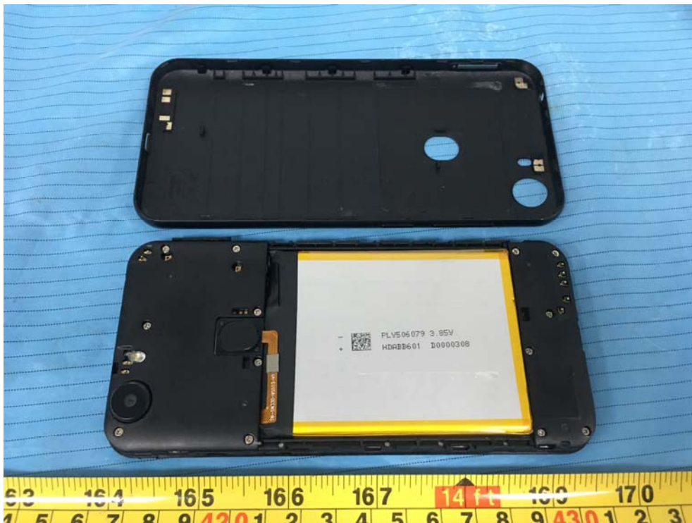
LTE Div Antenna