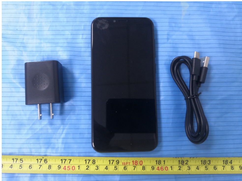
EXHIBIT B - EUT EXTERNAL PHOTOGRAPHS