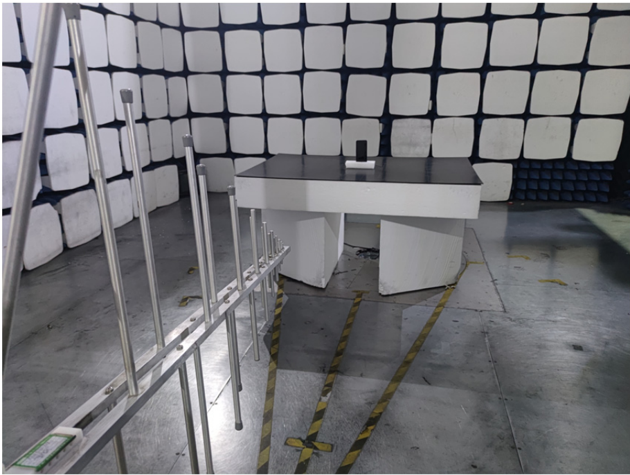
Radiation Emission Test Setup (1GHz to 18GHz)