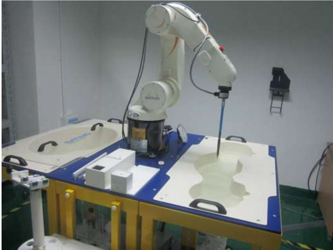
Liquid depth \geq 15\text{cm}