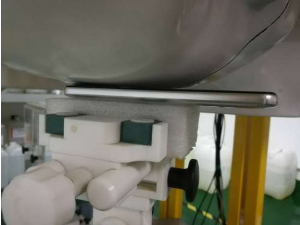
Right Head Tilt View