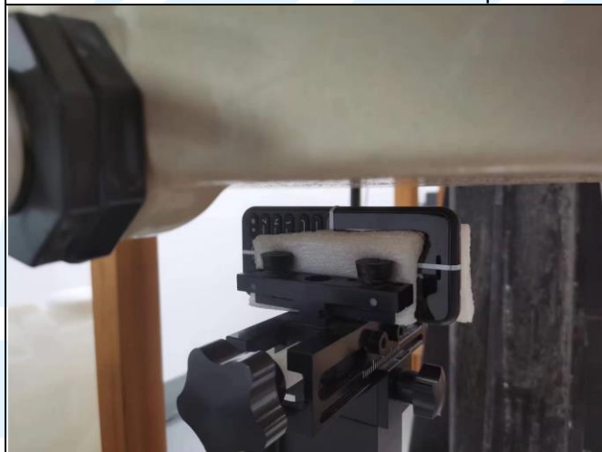
Left Side of EUT with 1.0 cm Gap