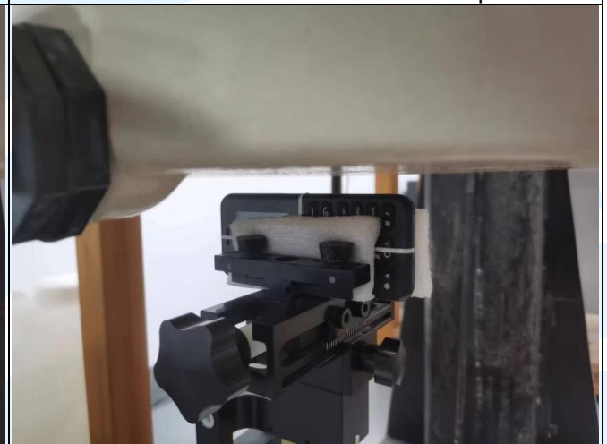
Right Side of EUT with 1.0 cm Gap