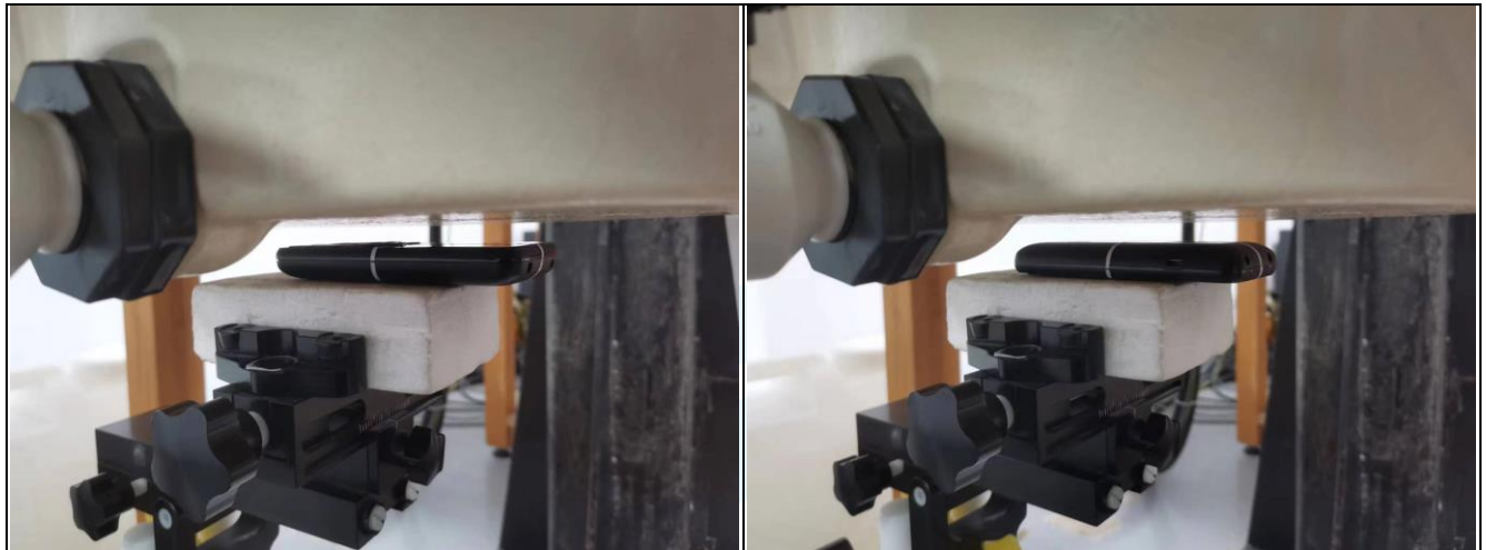
Front Face of EUT with 1.0 cm Gap