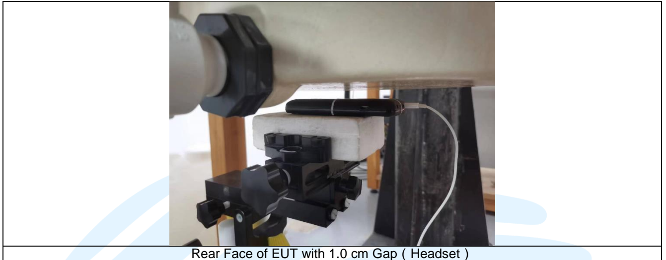
Rear Face of EUT with 1.0 cm Gap ( Headset )