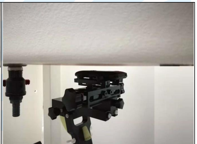
Rear Face of EUT with 1.0 cm Gap