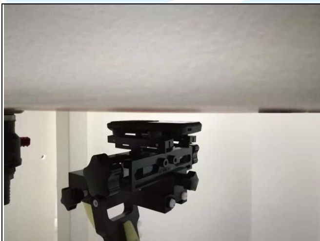
Front Face of EUT with 1.0 cm Gap