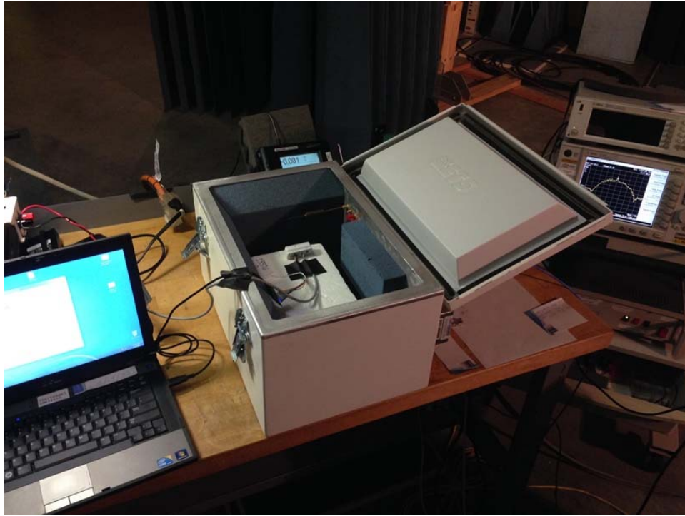
Band Edge, Bandwidth, and Duty Cycle