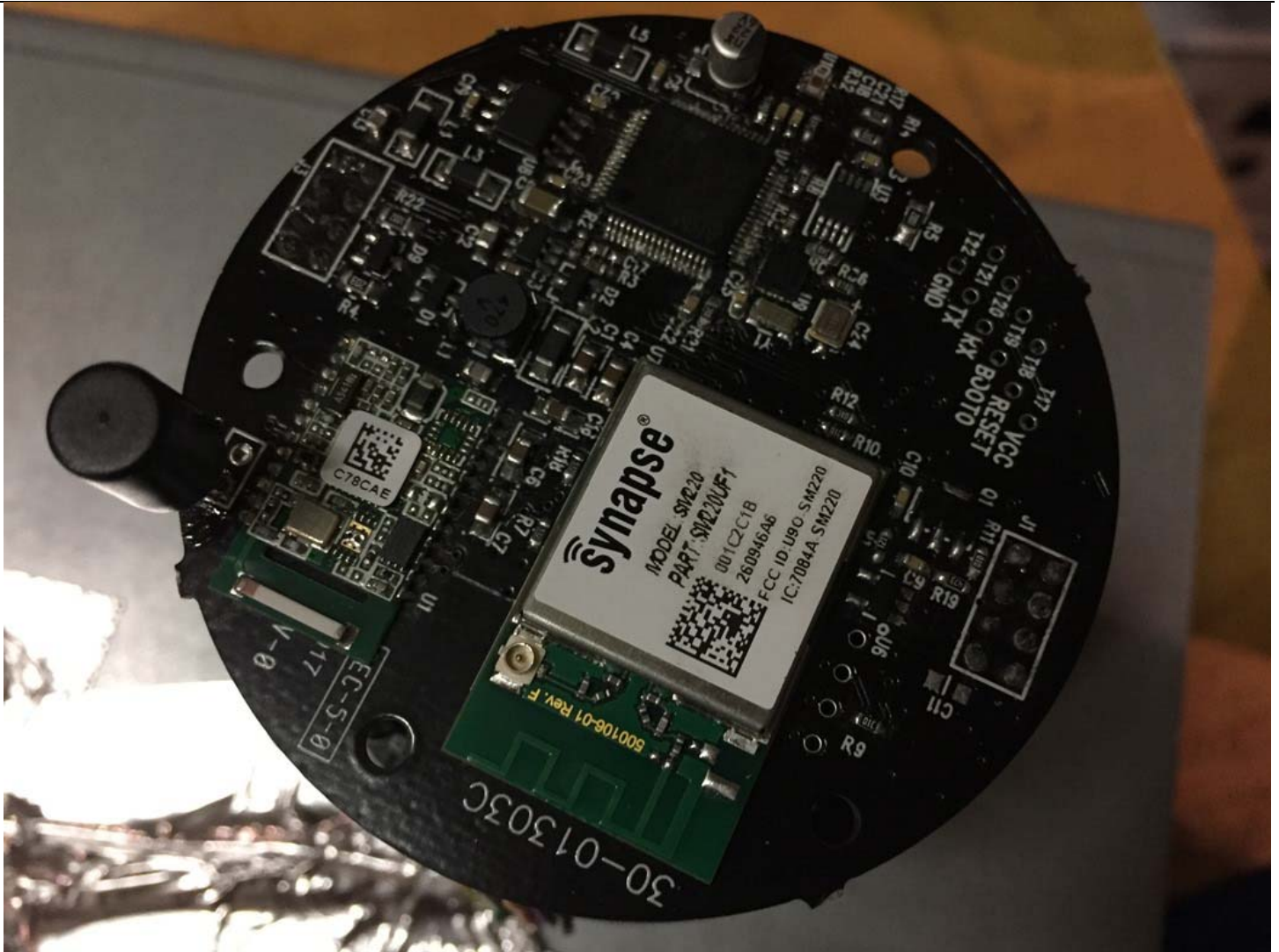
Board 2 Top; control board Antenna is black object on left edge of board next to Bluetooth module.