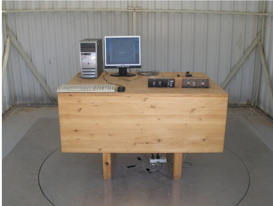
Photo 3. RE test setup on OATS.