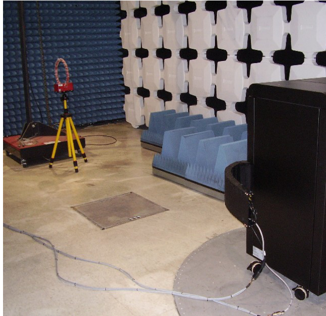
Photo 1. RE test setup