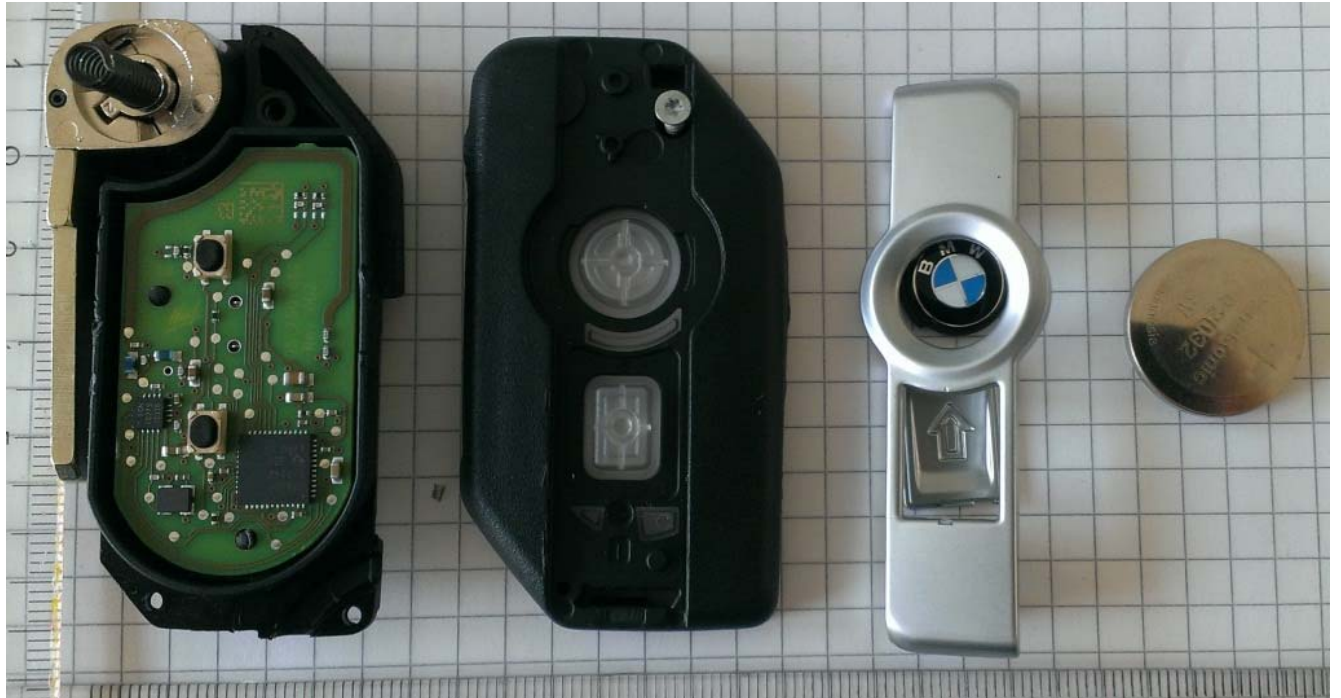
Pic. 3 Unit disassembled