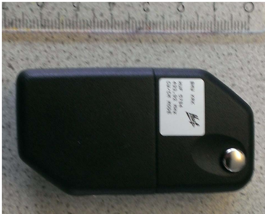
Pic. 2 Rear view