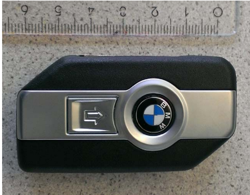
Pic.1 Top view