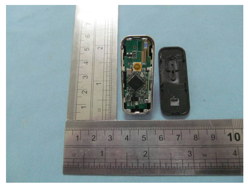
OPEN VIEW-2 OF EUT