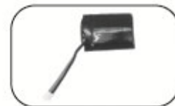
2 - Li-poly Batteries