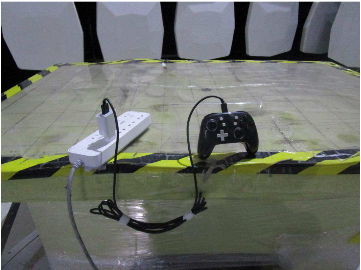
Up to 1GHz (The EUT placed at the center of the turntable)