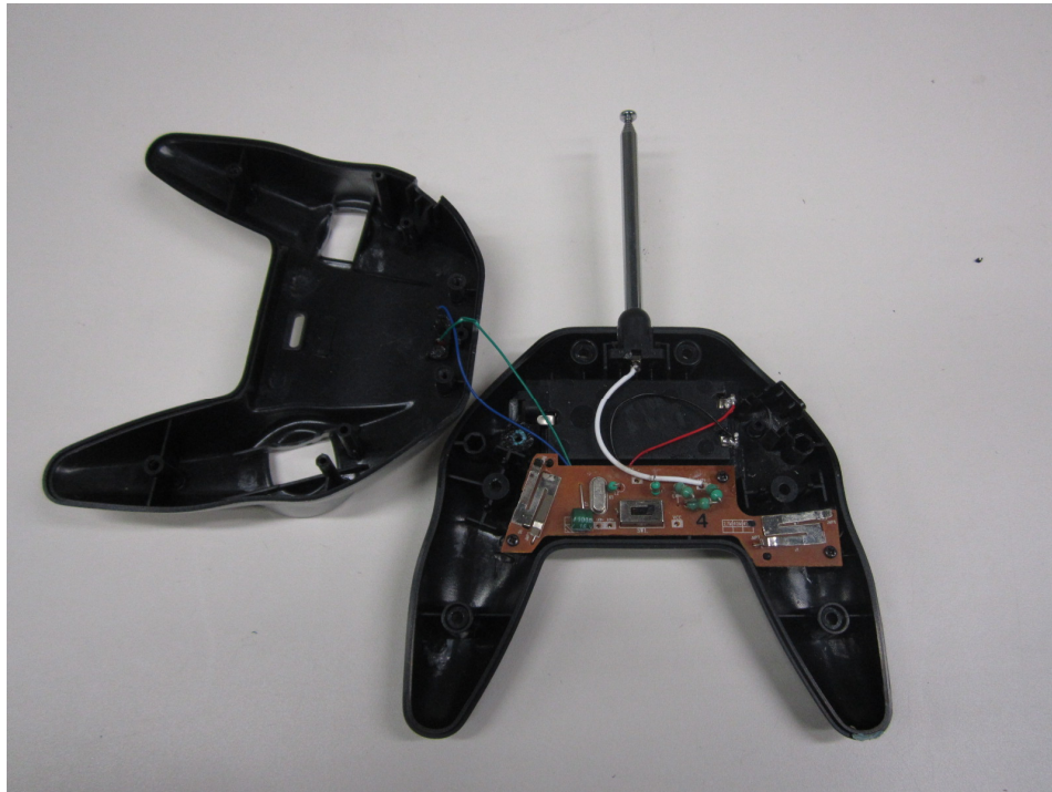
Transmitter (Internal view)