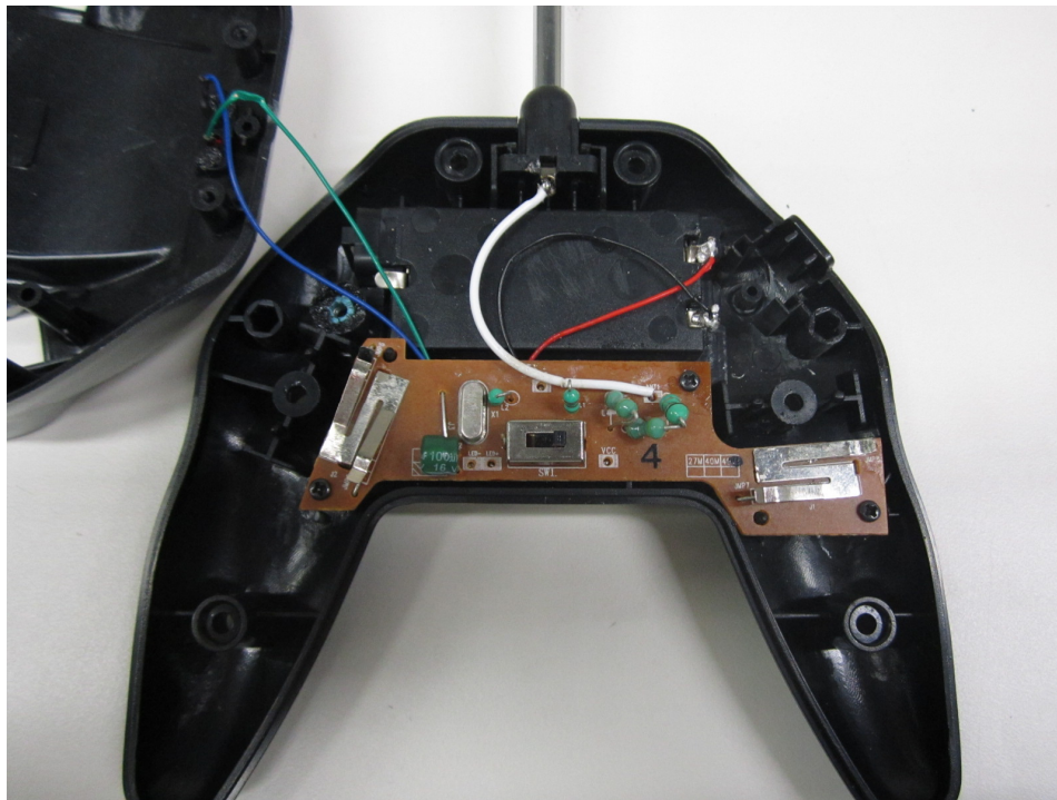
Transmitter (Internal view)