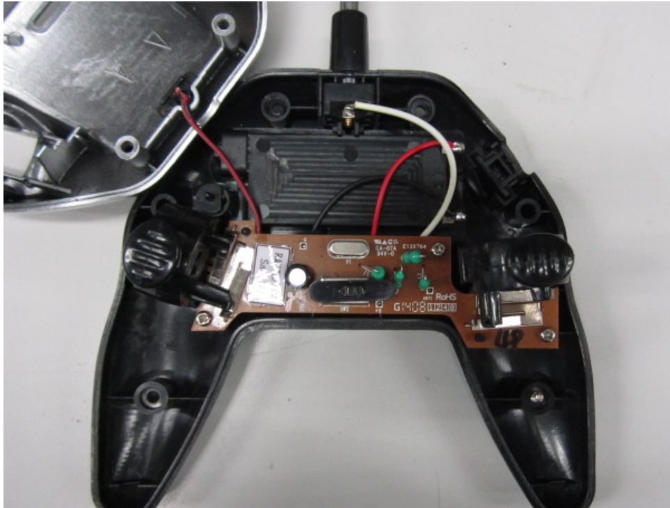
Transmitter (Internal view)