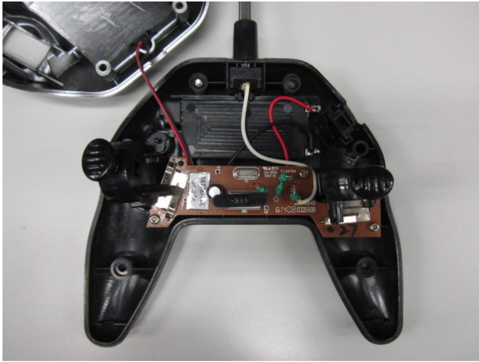
Transmitter (Internal view)