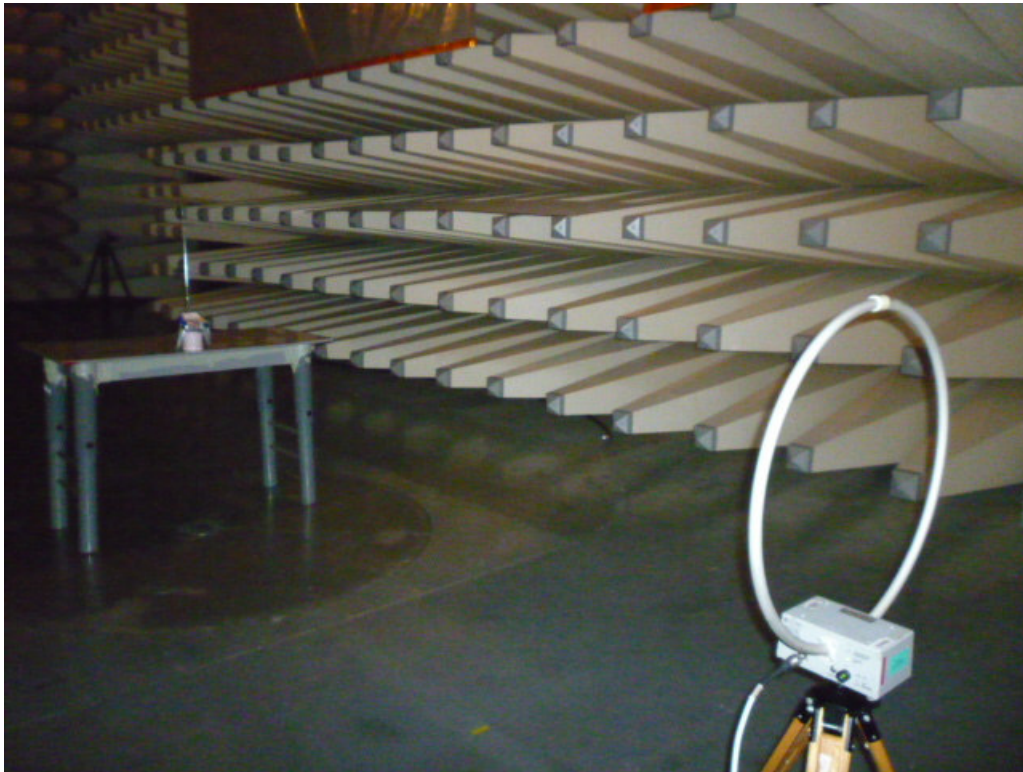
Set-up for Radiated Emission (Transmitter)