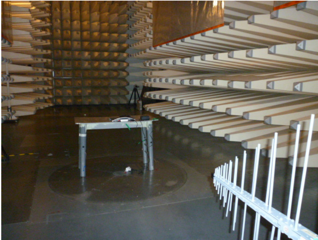
Setup for Radiated Emission