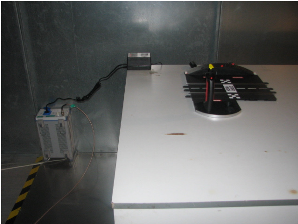
Setup for Conducted Emission