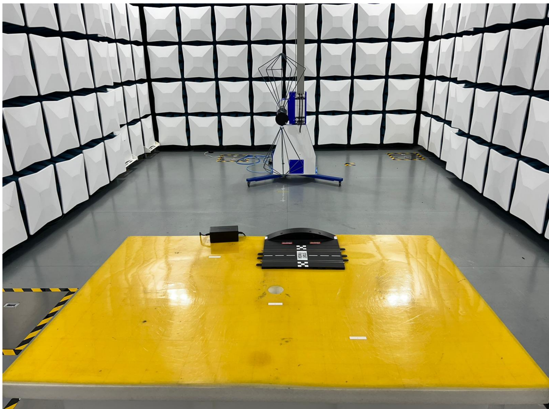
Set-up for Radiated Emission (30-200MHz)