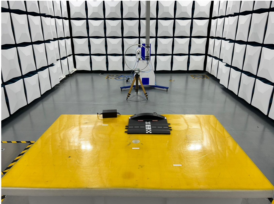
Set-up for Radiated Emission (9k-30MHz)