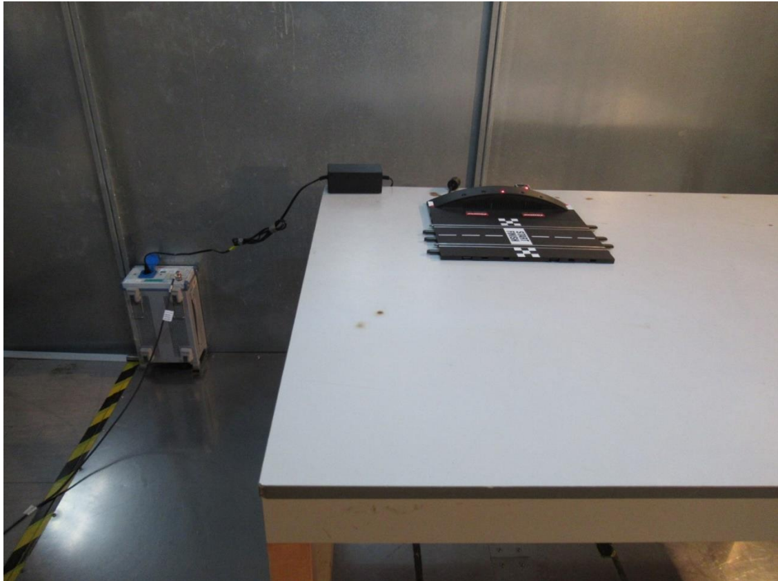
Conducted Emission on AC Mains