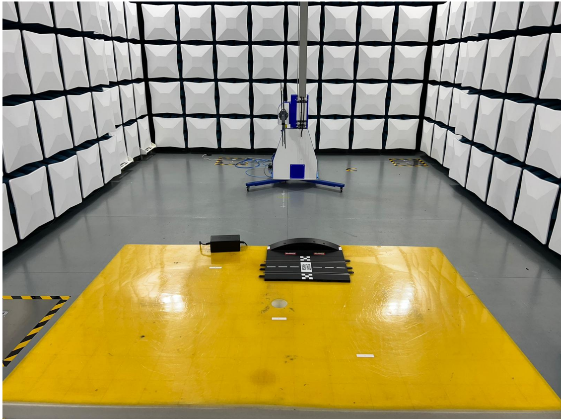
Set-up for Radiated Emission (200-1000MHz)