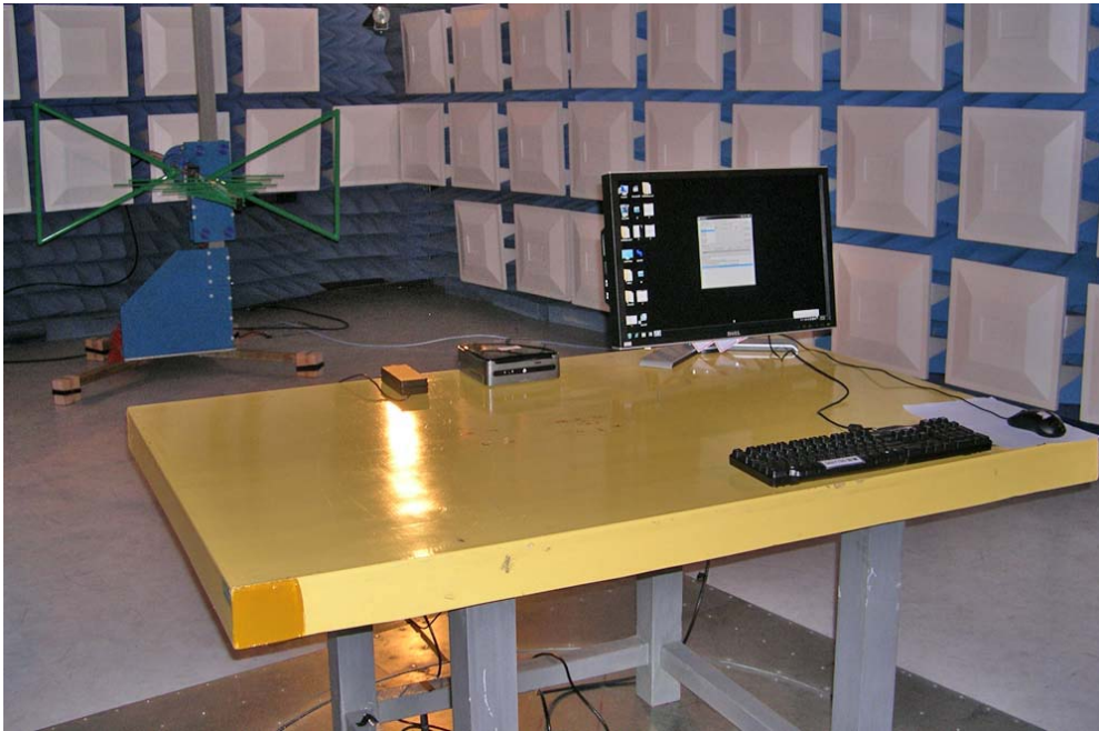
The Back View of Highest Radiated Set-up For EUT