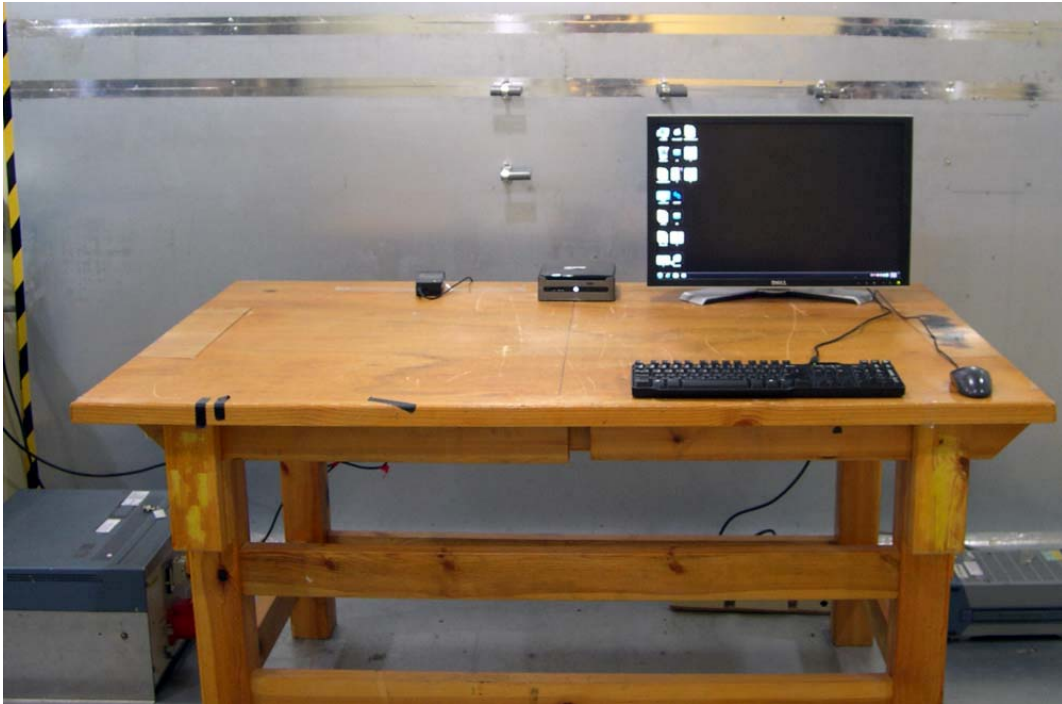
The Front View of Highest Conducted Set-up For EUT