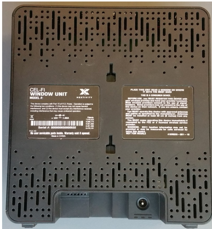
Back - NU