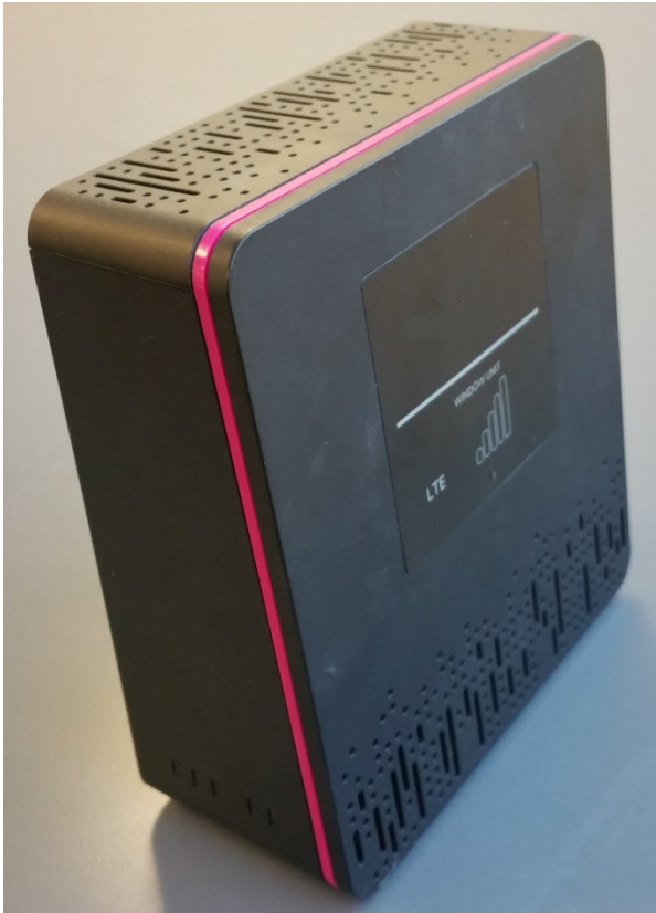
Front / Top / Side- NU