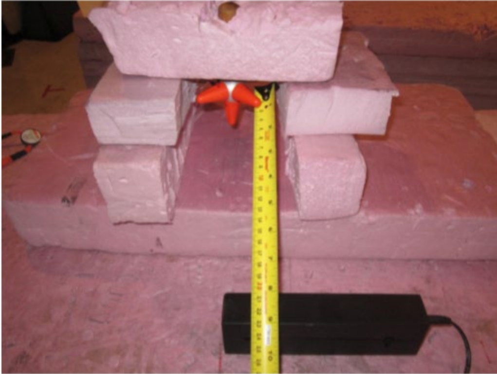
Test Point 8