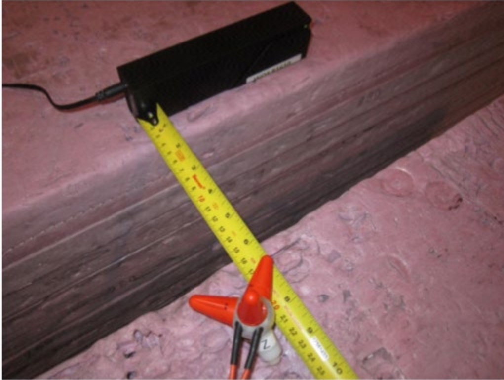
Test Point 2