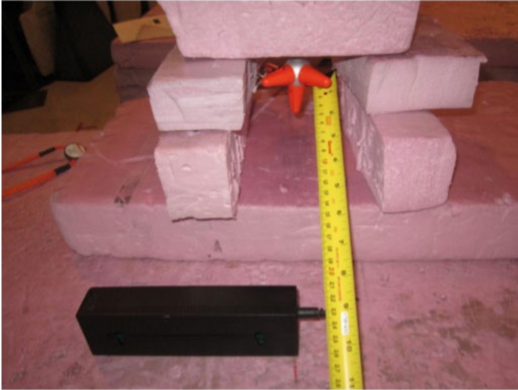
Test Point 6