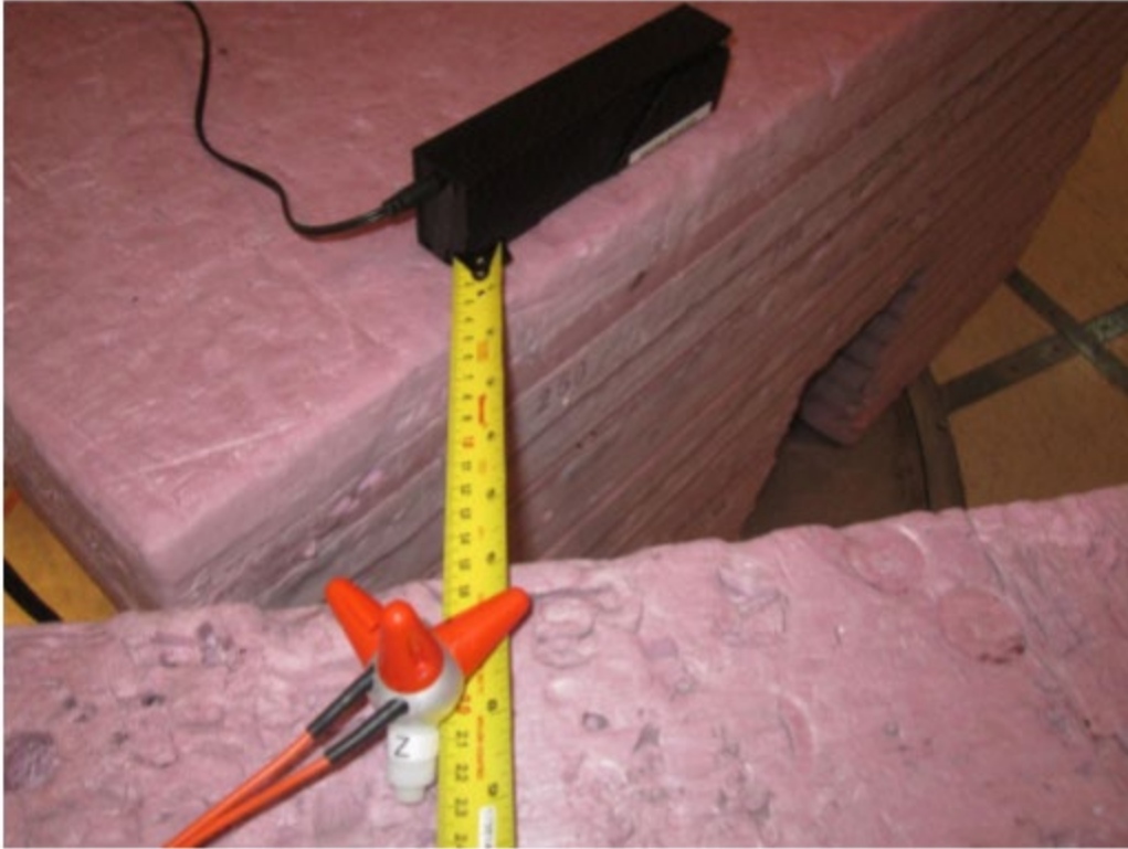
Test Point 4