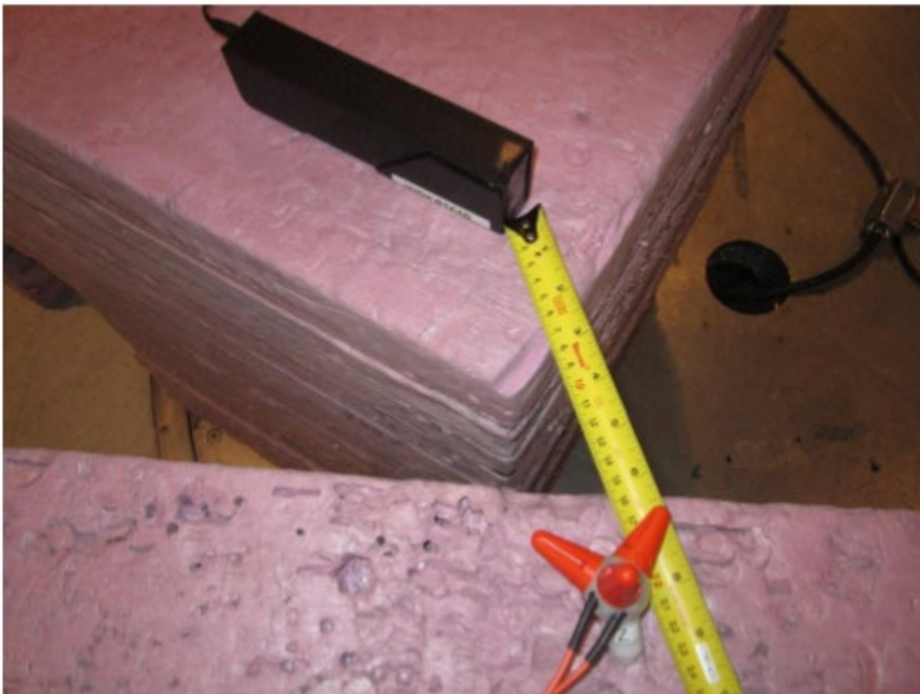
Test Point 5