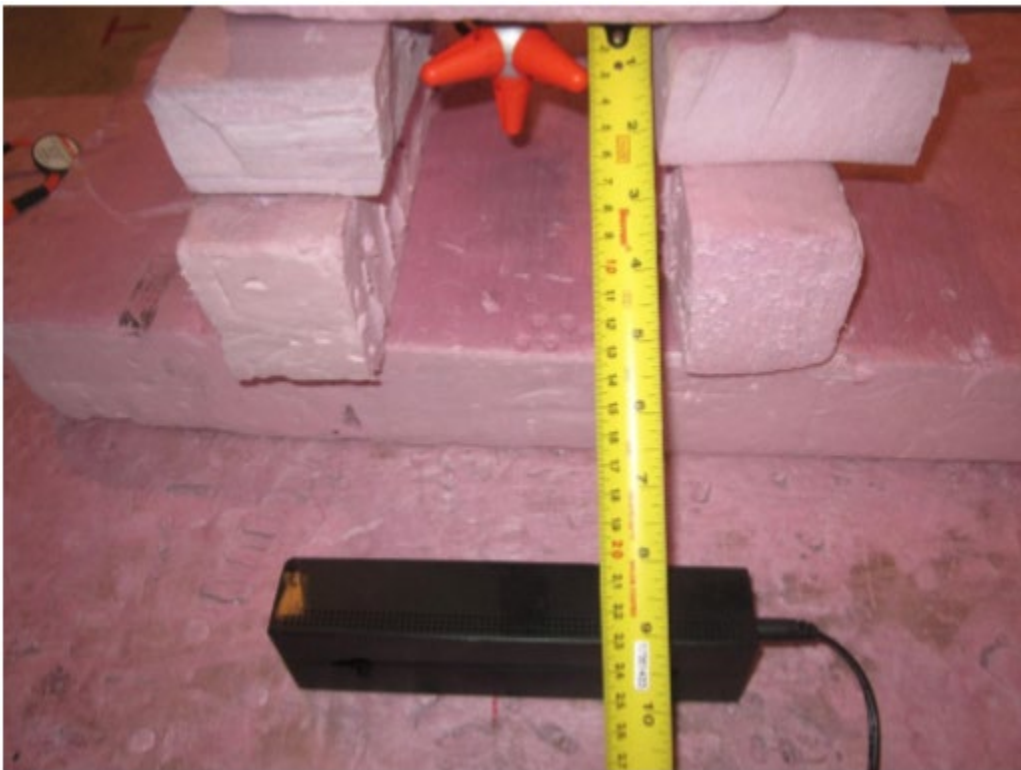
Test Point 7