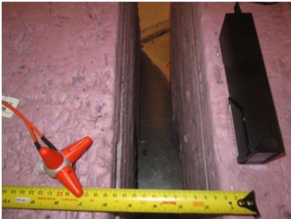
Test Point 3