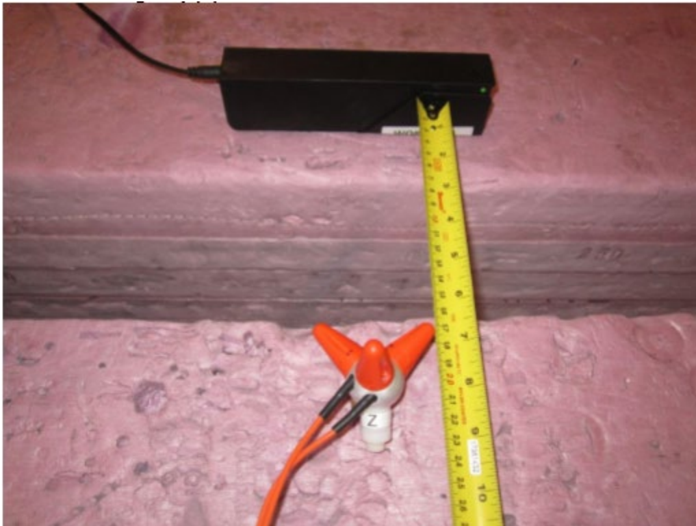
Test Point 1