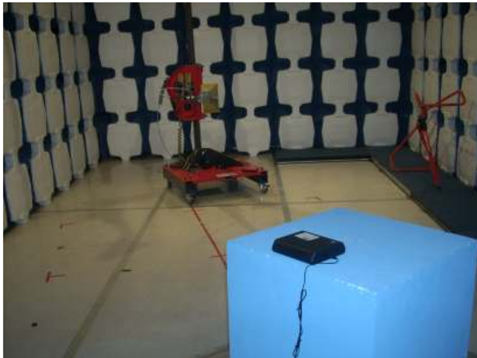
Radiated Emissions – Above 1GHz – Tabletop Mount