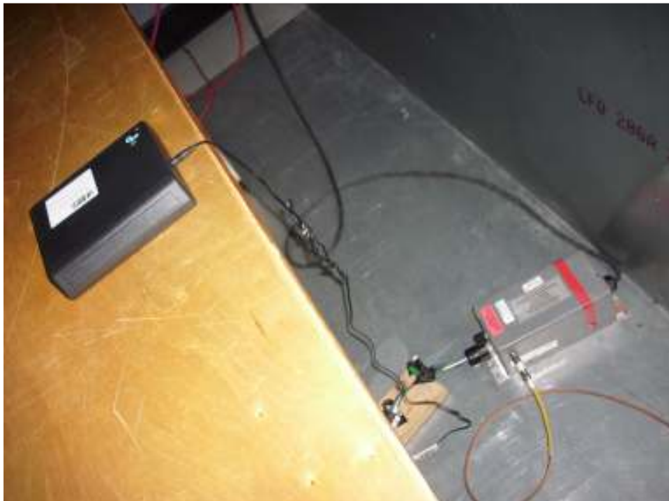
AC Line Conducted Measurements – Rear – Tabletop Mount