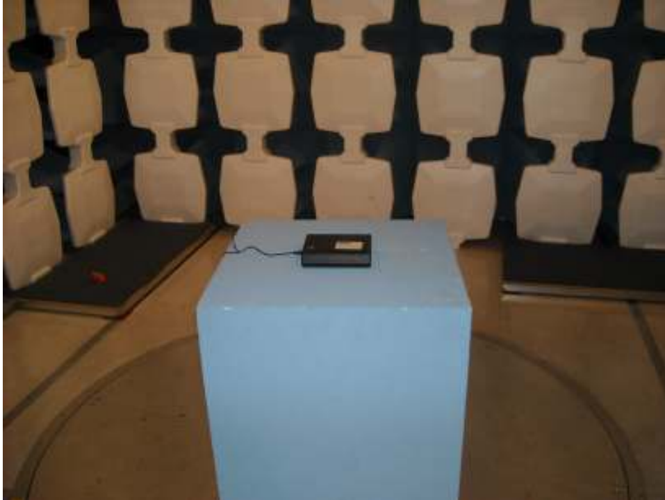
Radiated Emissions – Below 1GHz – Tabletop Mount