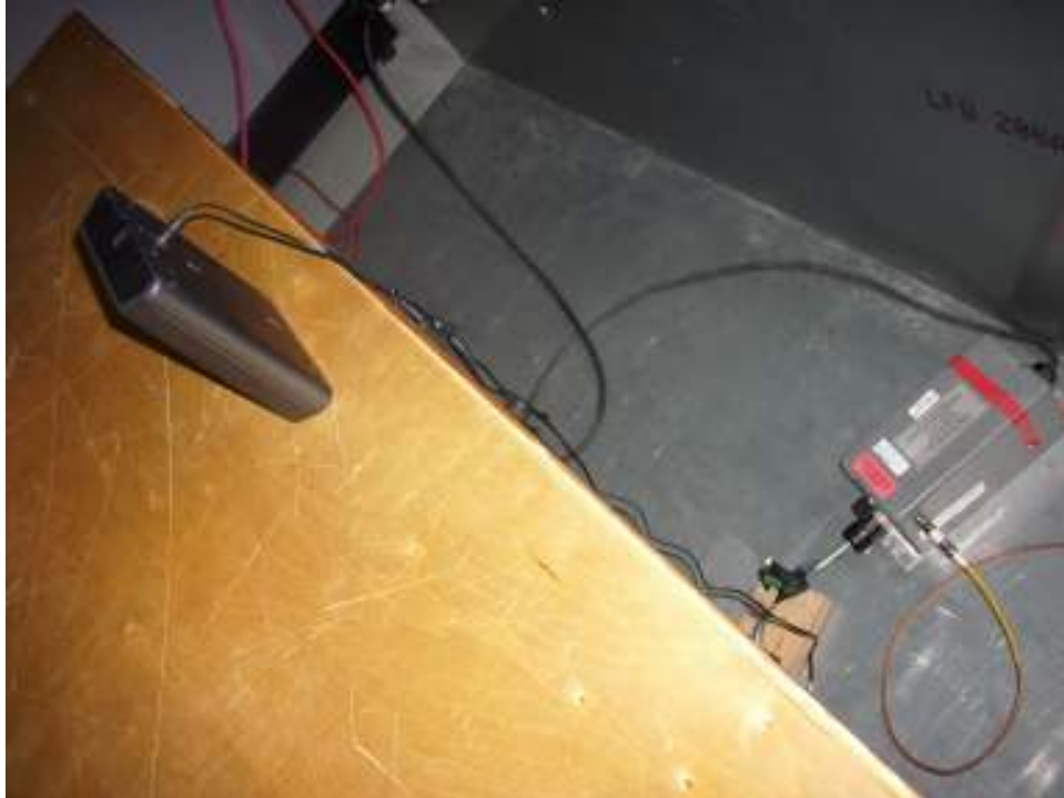
AC Line Conducted Measurements – Rear – Wall Mount