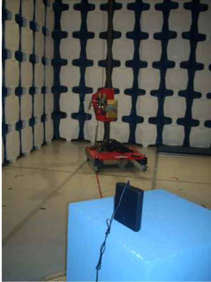
Radiated Emissions – Above 1GHz – Wall Mount