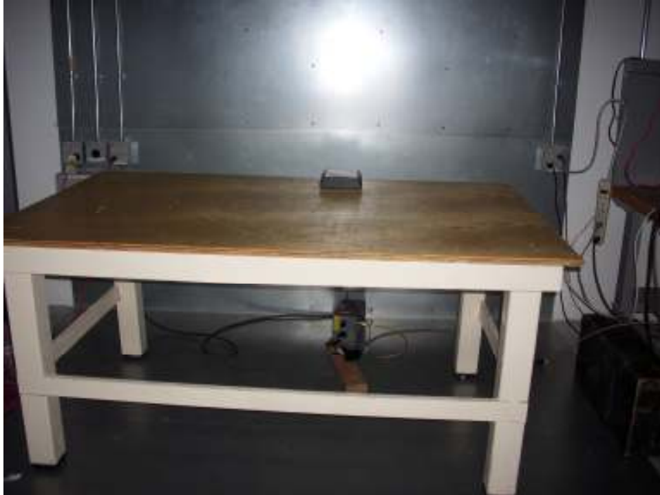
AC Line Conducted Measurements – Front – Tabletop Mount