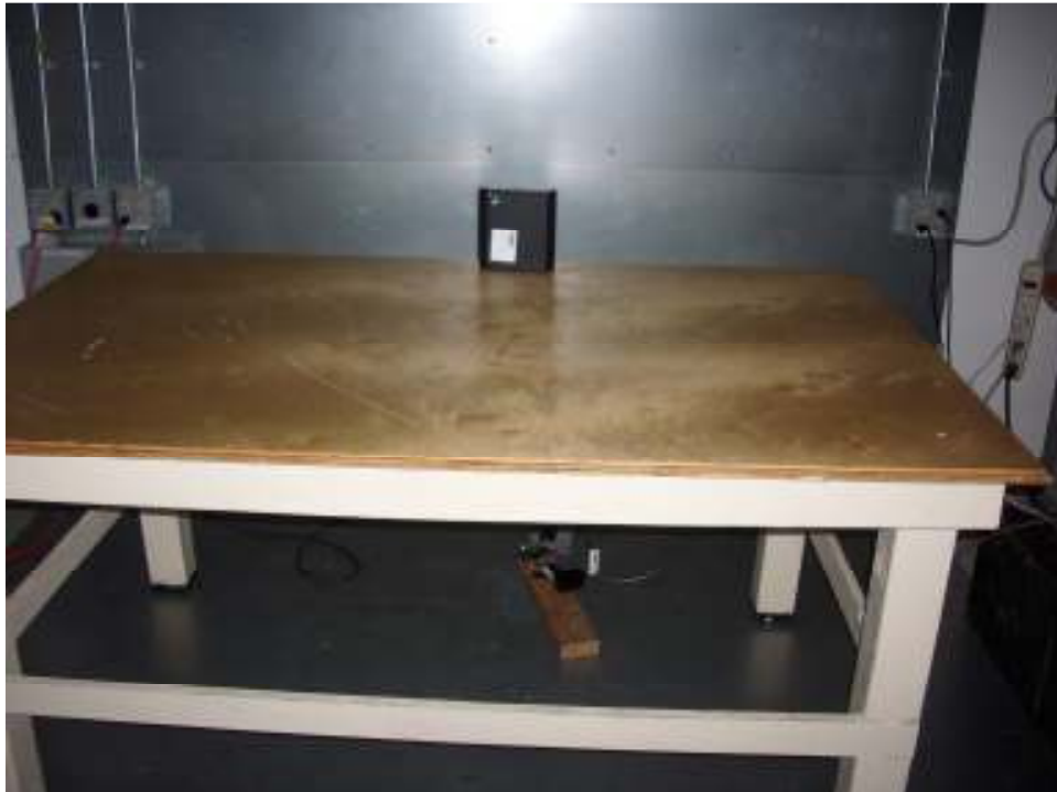
AC Line Conducted Measurements – Front – Wall Mount