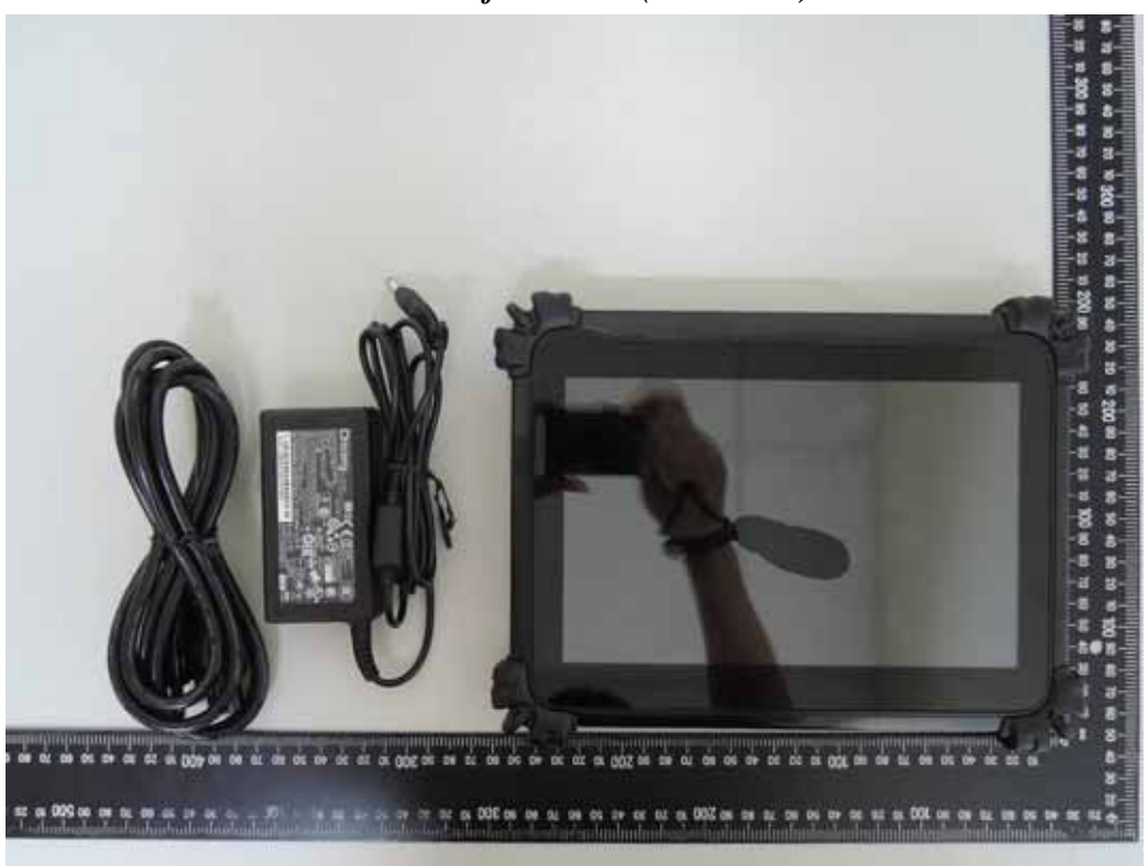
All View of EUT - 2 (Atlas 91i)