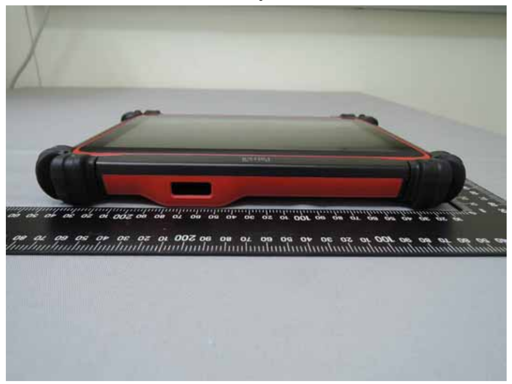
Side View of EUT - 4