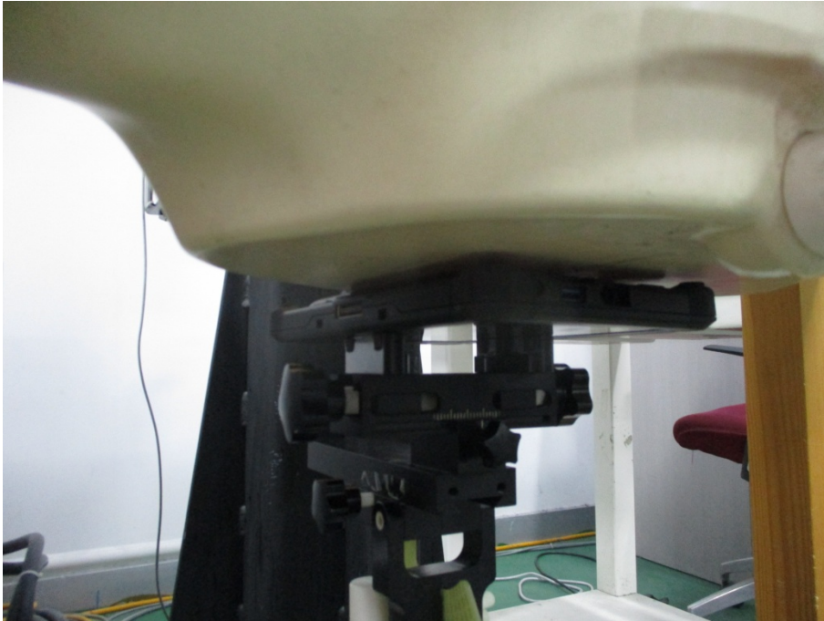
Body Left Setup Photo(0mm)