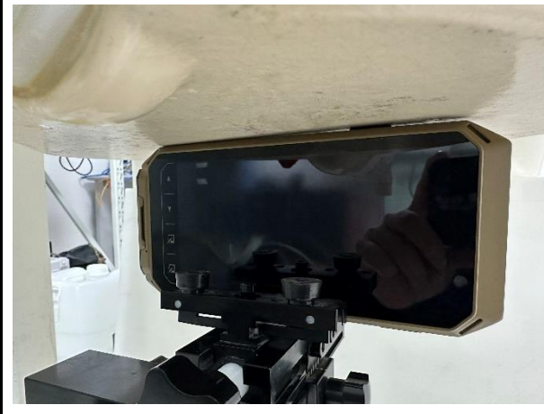
Edge 4 0mm