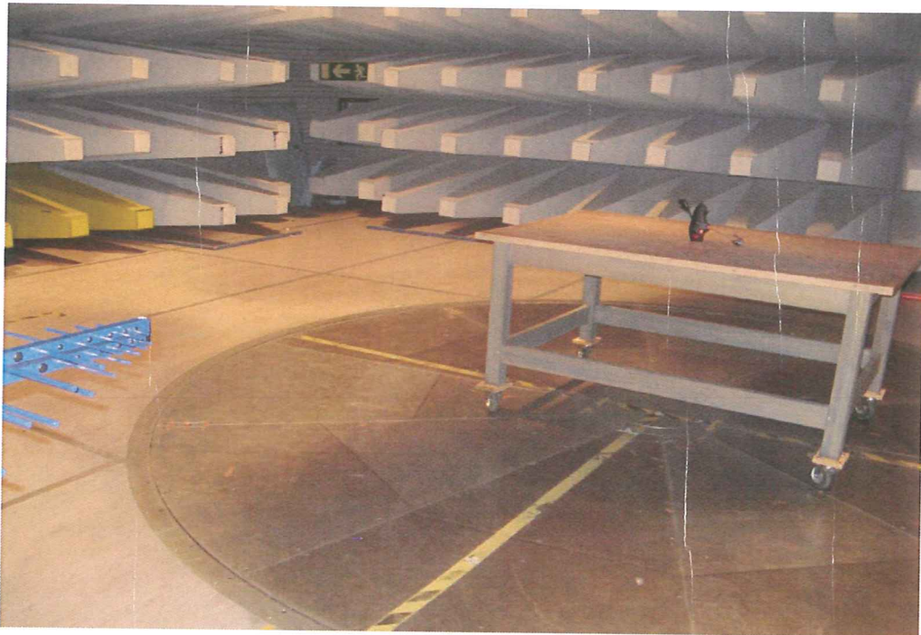
Photo 4.8.1 Test setup regarding measurement of spurious emission.