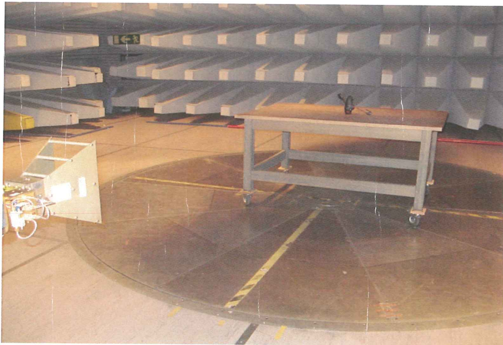
Photo 3.1.2 Test setup regarding spurious emission measurements.