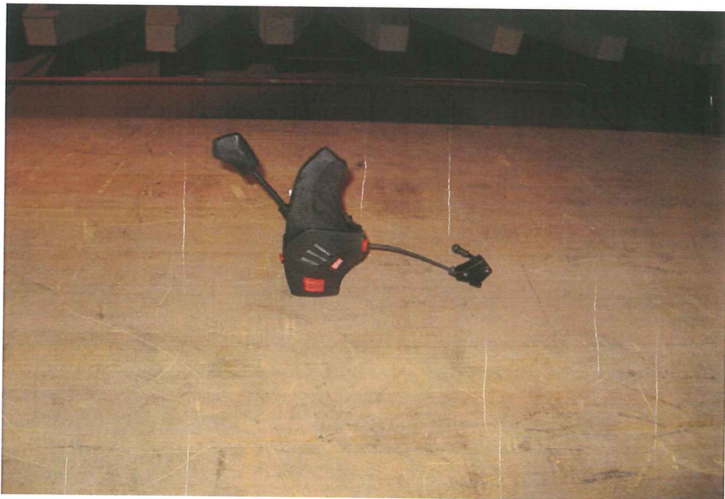
Photo 4.8.2 Test setup regarding measurement of spurious emission.