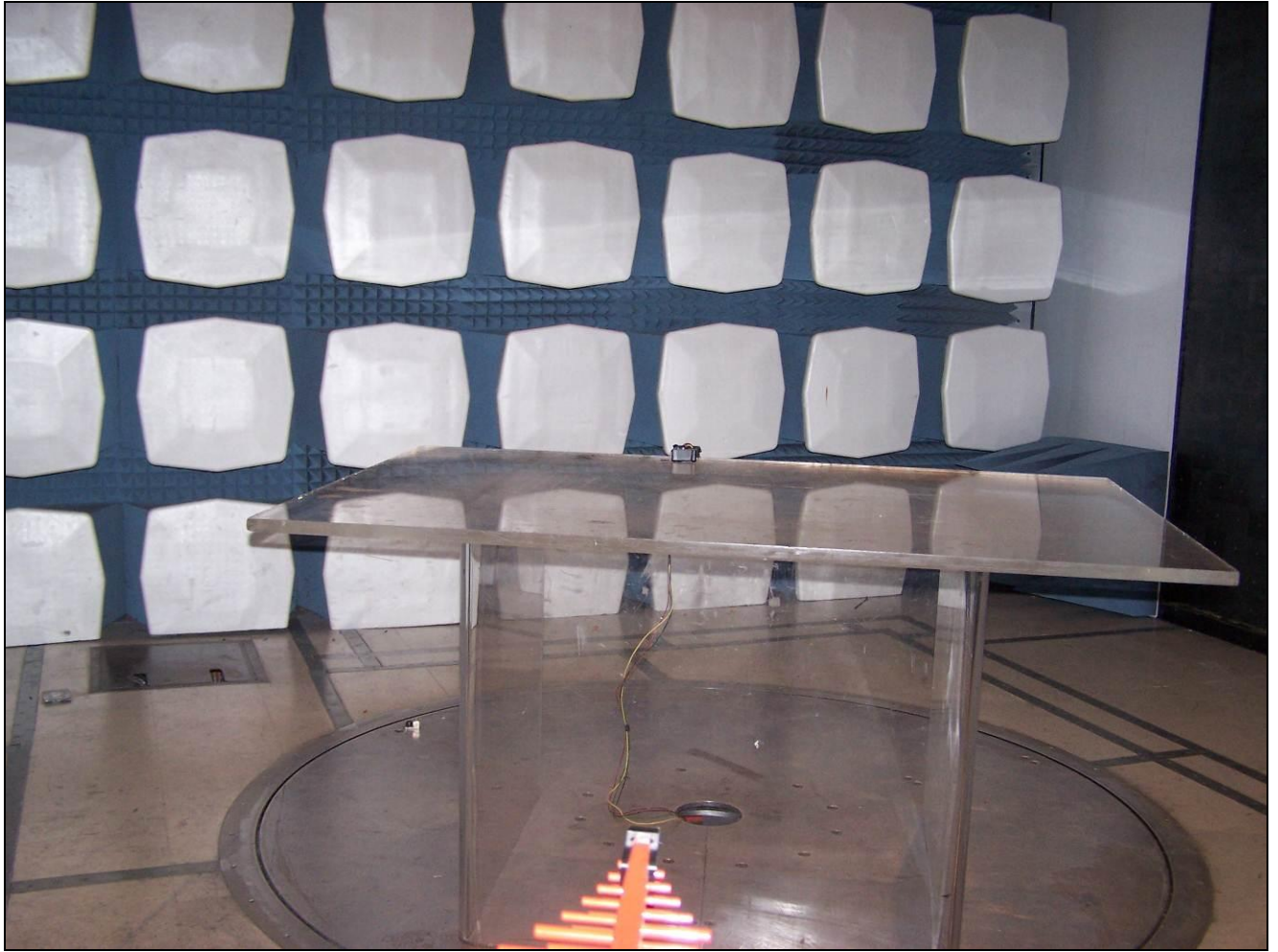
Photograph 1. Radiated Emissions, Test Setup