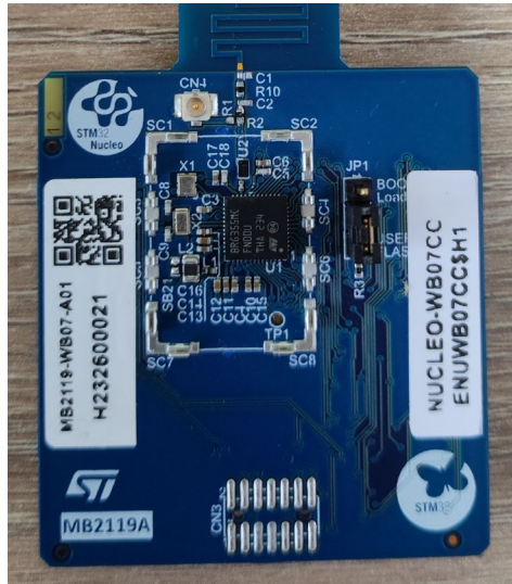
Cover removed (RF part)