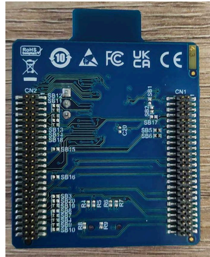
Rear side of MB2119A