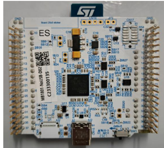
Module + MB1801D board