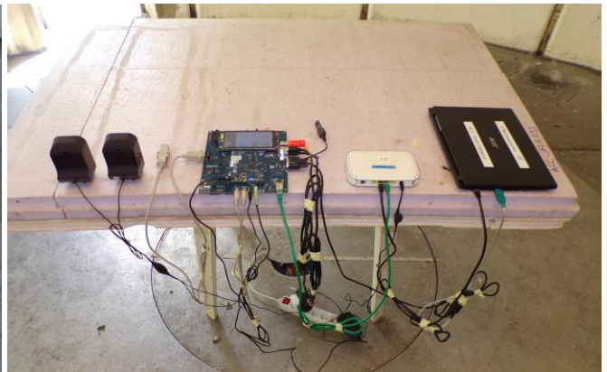
Open Area Test site (30M-1GHz)