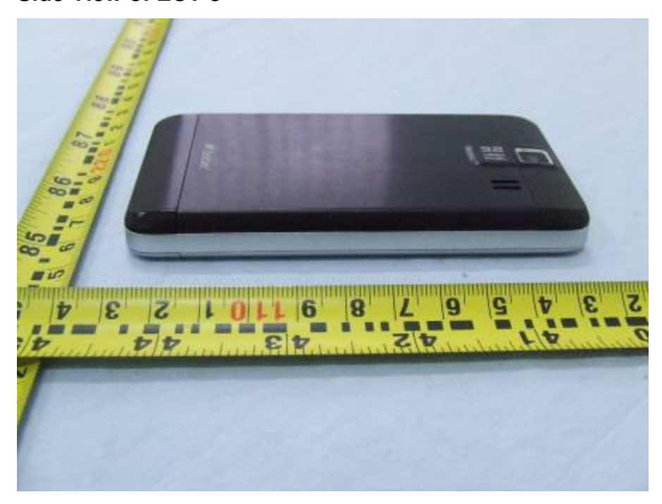
Side View of EUT-4