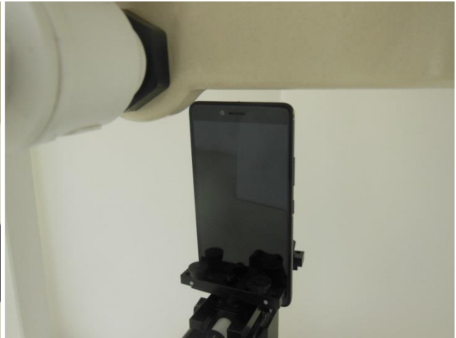
Top Side, Test Separation 10 mm