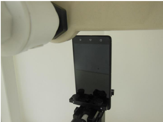
Bottom Side, Test Separation 10 mm