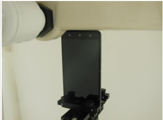
Bottom Side, Test Separation 0 mm