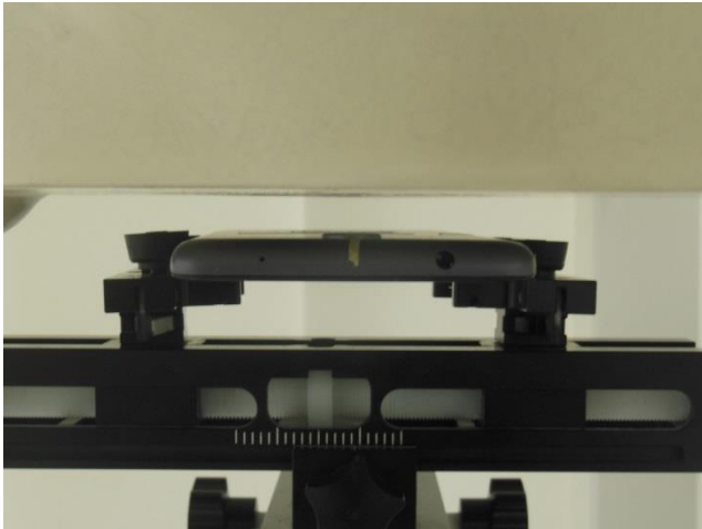
Back, Test Separation 10 mm