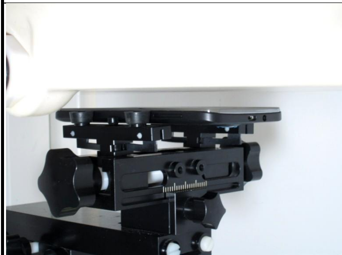
Front Face of EUT with 1.0 cm Gap