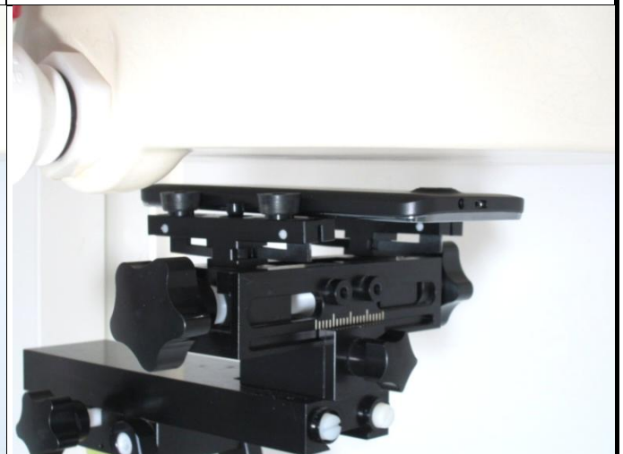
Rear Face of EUT with 1.0 cm Gap