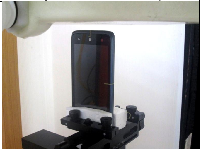
Bottom Side of EUT with 1.0 cm Gap