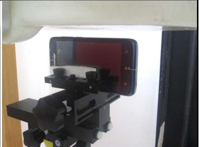
Right Side of EUT with 1.0 cm Gap