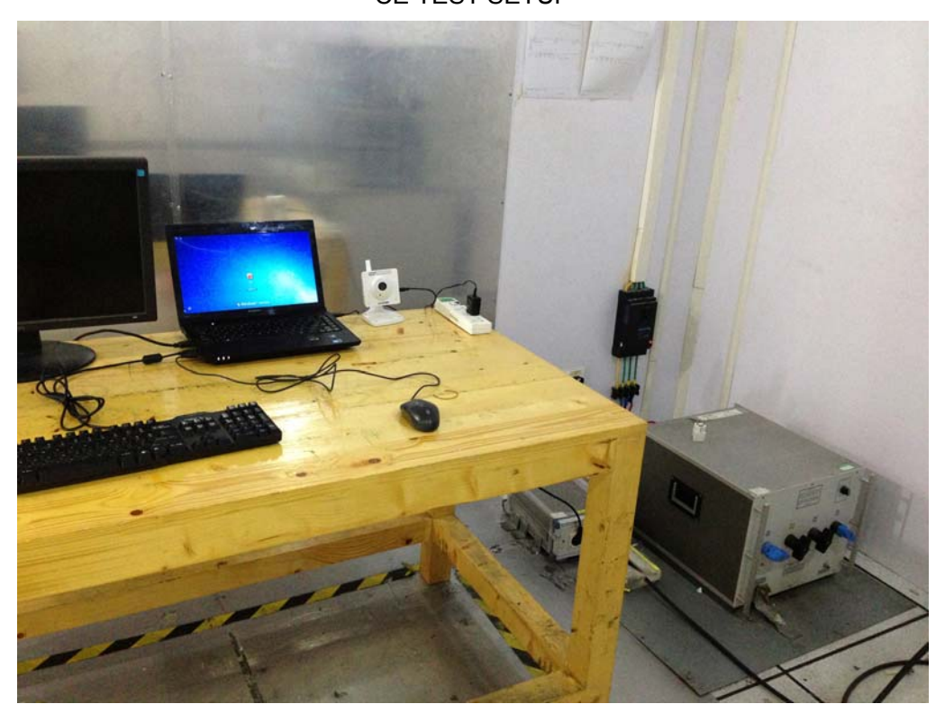
RE TEST SETUP