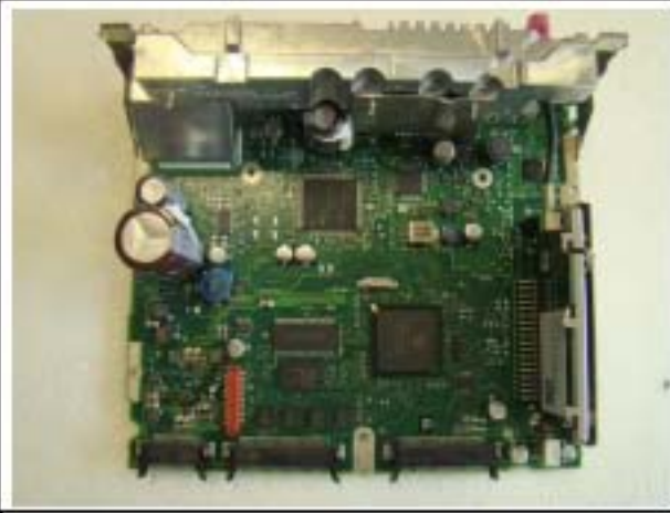
PCB 2 TOP