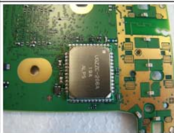
BT MODULE WITH SHIELDING