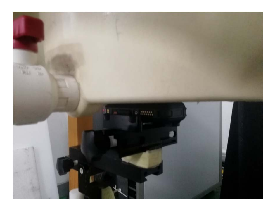
Handheld Back Setup Photo(0mm)