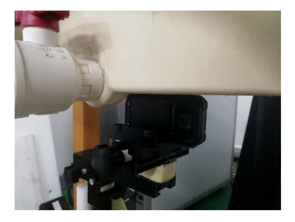
Handheld Right Setup Photo(0mm)