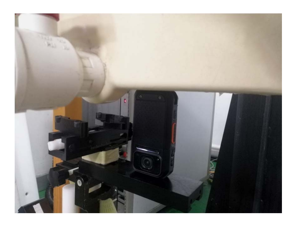
Handheld Top Photo(0mm)