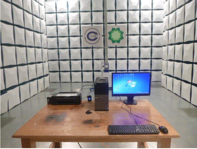
Radiated Emissions (Above 1GHz)