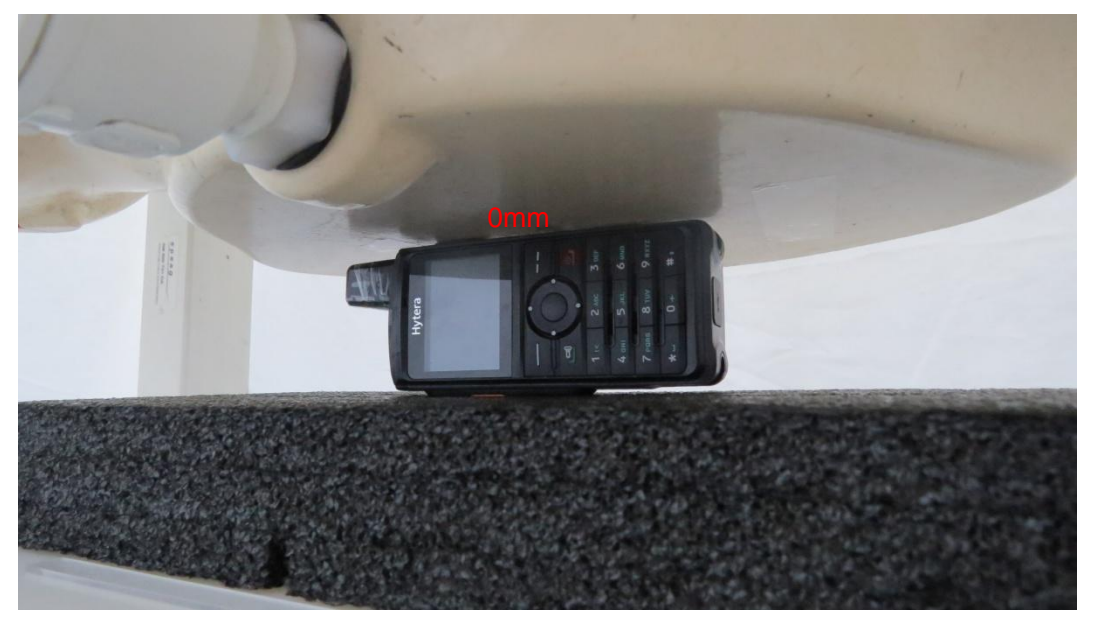
Picture 6: Right Side, the distance from handset to the bottom of the Phantom is 0mm