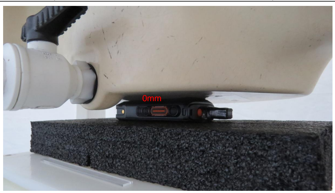
Picture 3: Back Side, the distance from handset to the bottom of the Phantom is 0mm