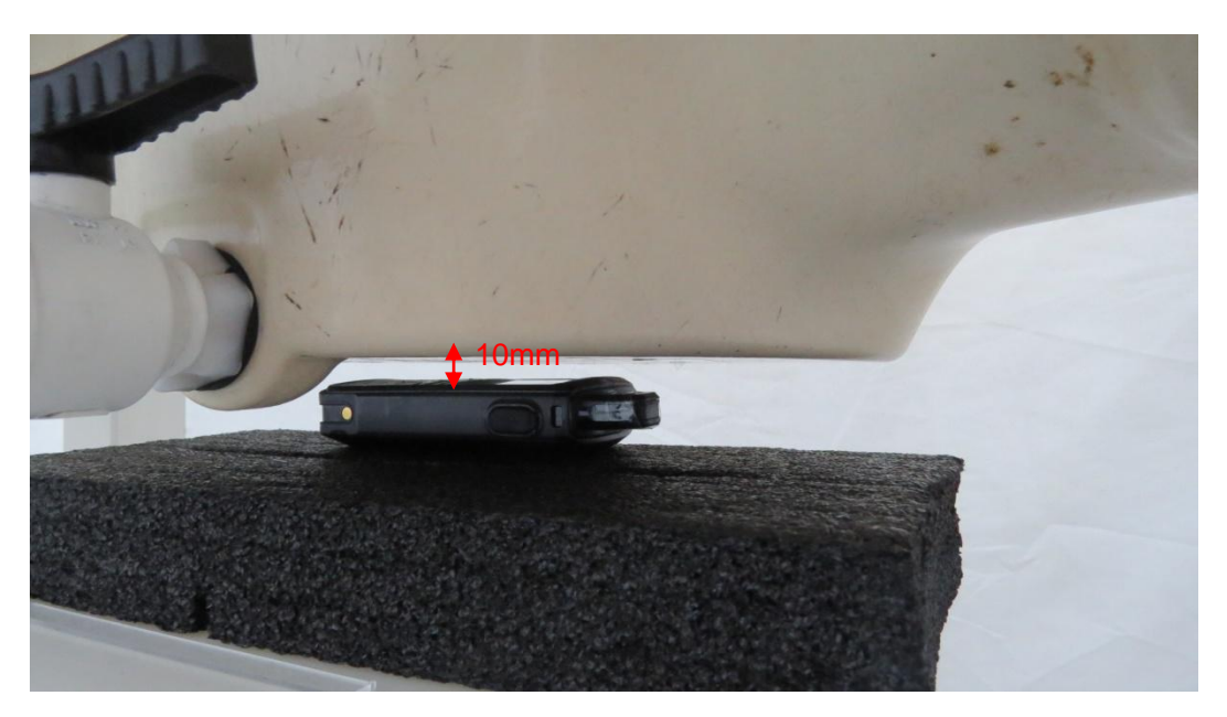
Picture 1: Front Side, the distance from handset to the bottom of the Phantom is 10mm