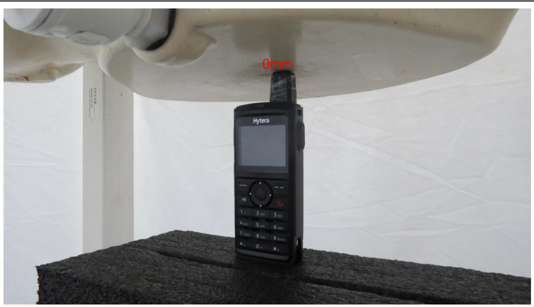
Picture 7: Top Side, the distance from handset to the bottom of the Phantom is 0mm