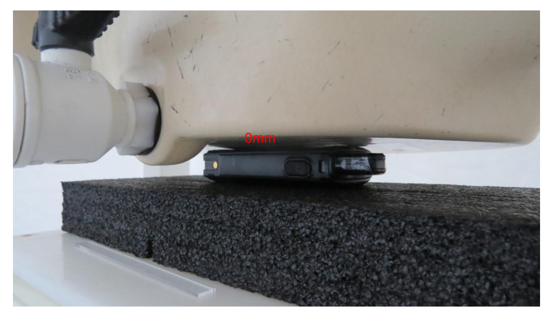
Picture 2: Front Side, the distance from handset to the bottom of the Phantom is 0mm