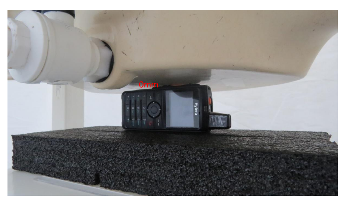
Picture 5: Left Side, the distance from handset to the bottom of the Phantom is 0mm