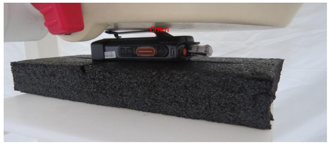
Picture 4: Back Side, the distance from handset to the bottom of the Phantom is 0mm(Body-worn)