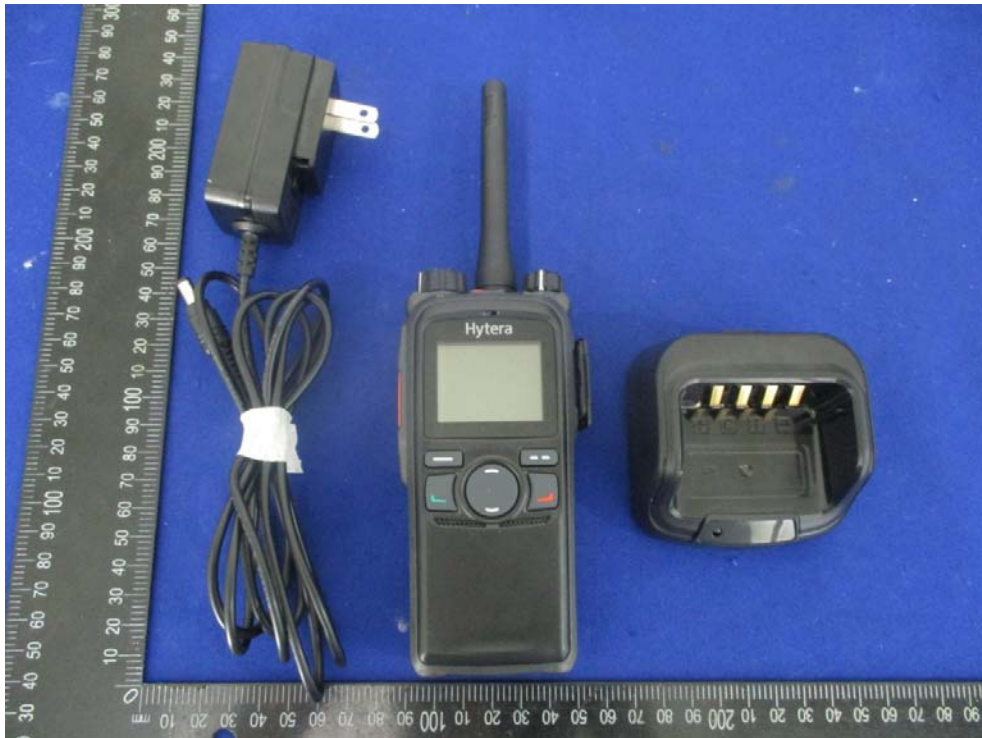
EUT – All View