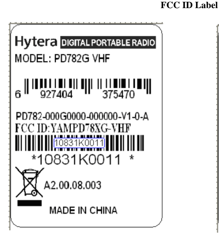
EXHIBIT A - FCC ID LABELING AND LOCATION