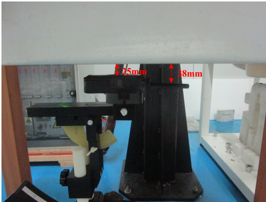
Body Worn Back Setup Photo(0mm)