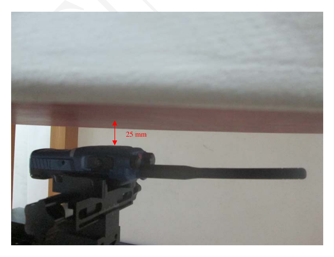
Face up (2.5cm)

Note : This test report is prepared for the customer shown above and for the equipment described herein. It may not be duplicated or used in part without prior written consent from Bay Area Compliance Laboratories Corp.